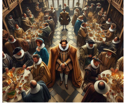
The 'Imprisonment' of Don Pedro