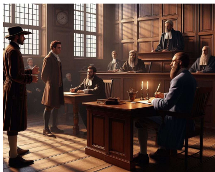
A Precarious Position