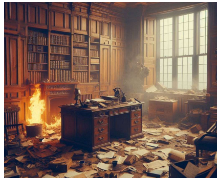
Fire by Misadventure