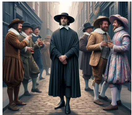
Comfortable in his own Skin