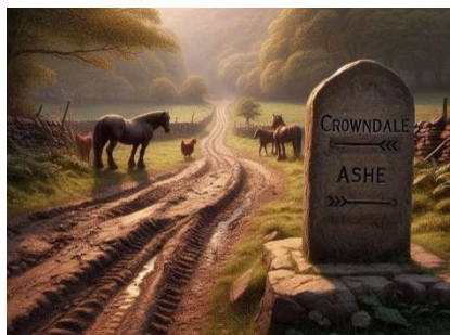
The Mythical Fork in the Road