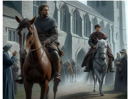
Departure from Buckland Abbey 1593